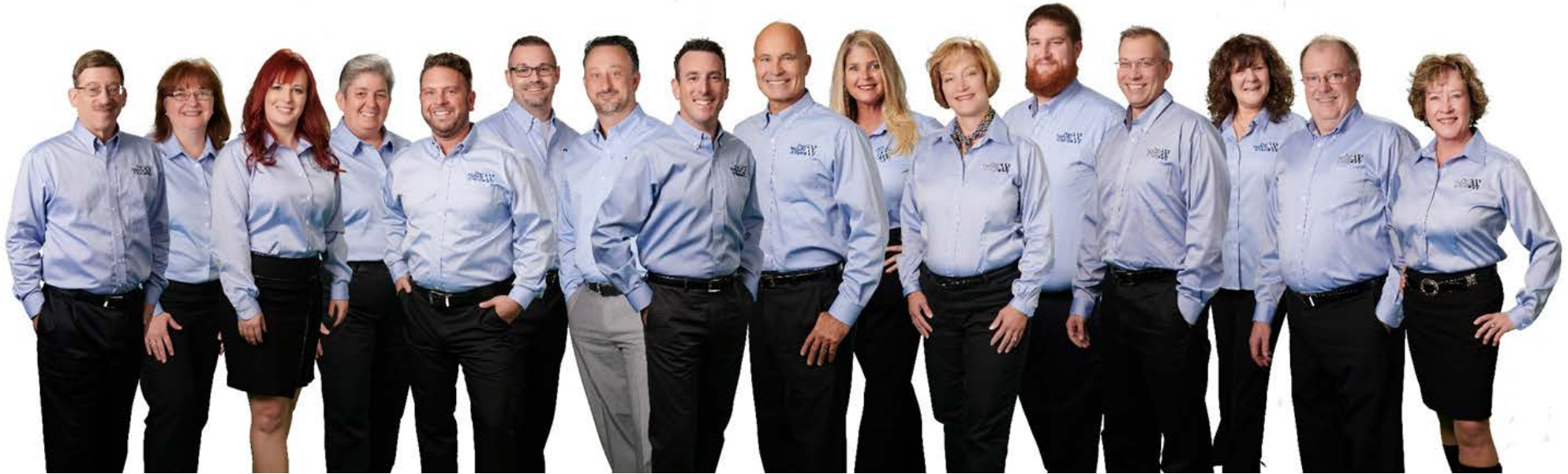
The PWW Team - 2019