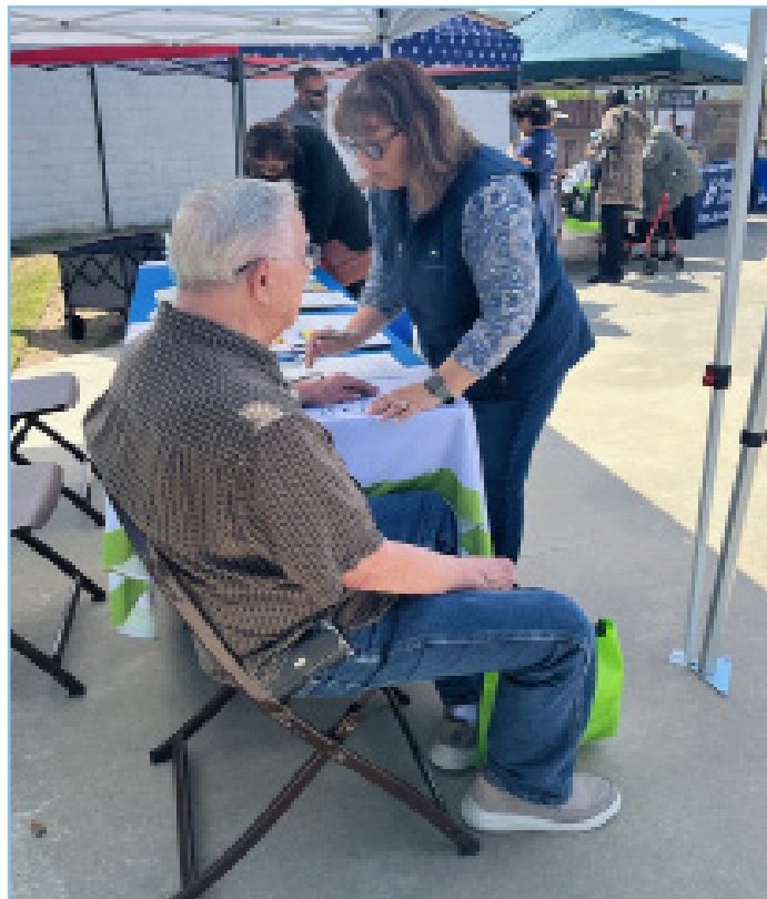
Health Screenings at Santa Paula Senior Center's Health & Wellness Expo