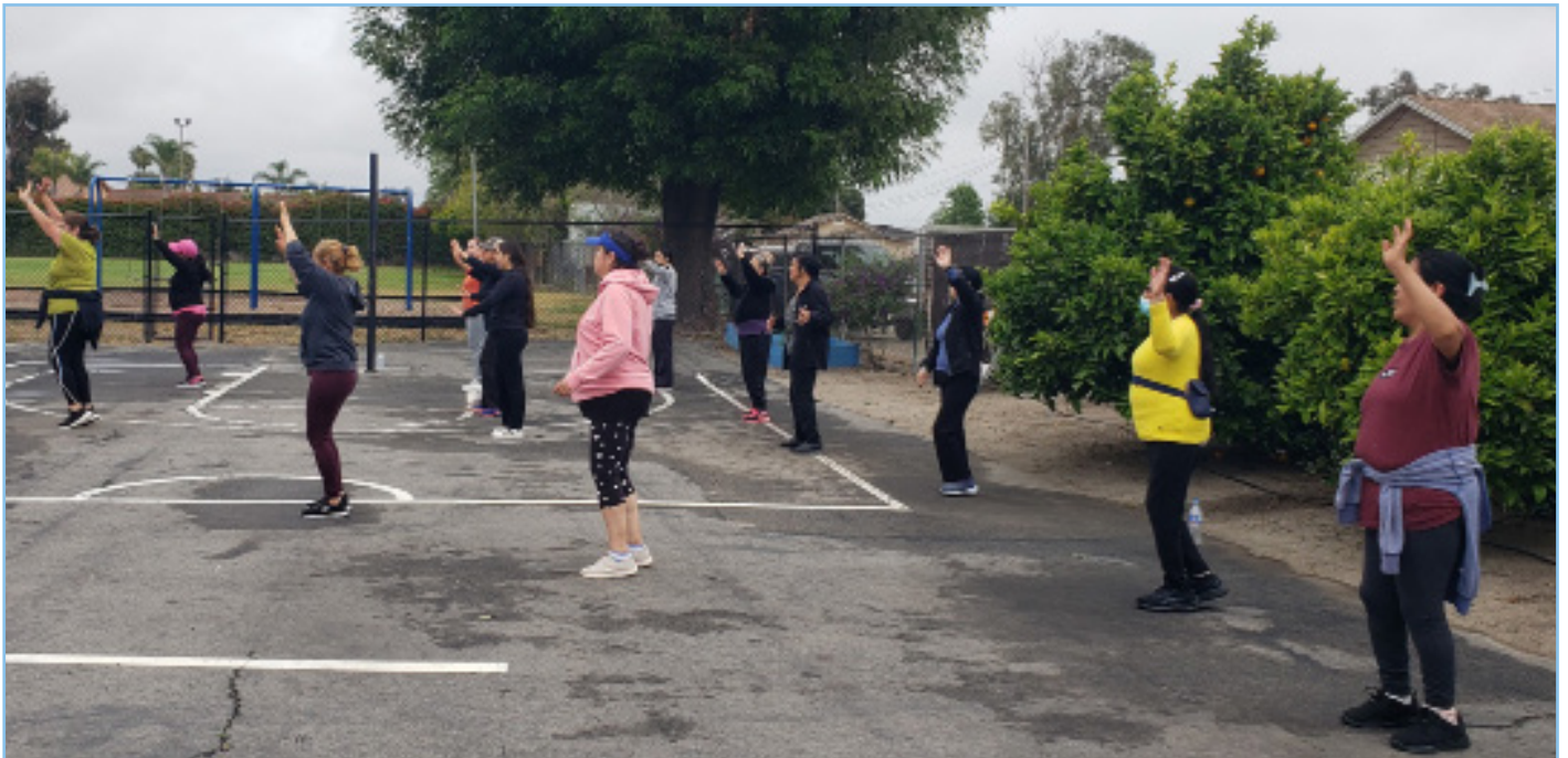
Participants enjoying physical activity with Zumba® at Nyeland Acres Community Center, Oxnard

Exercising in a group is fun! ¡El ejercicio en grupo es divertido!