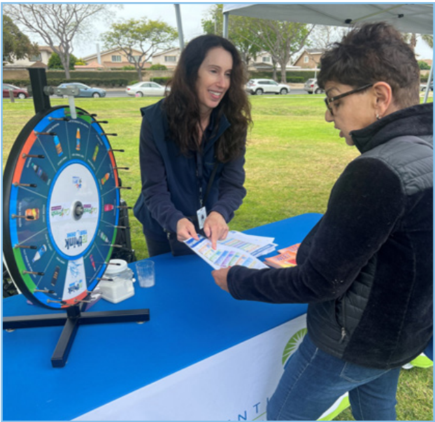
The CFHL team promoting the reduction of sugary beverages and encouraging water consumption at the Gold Coast Health Plan Resource Fair in Oxnard.